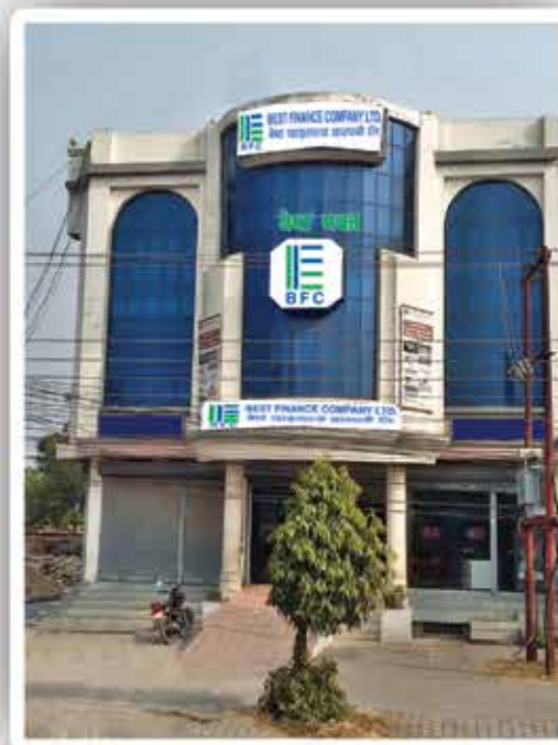
Best Building Milanchowk, Butwal