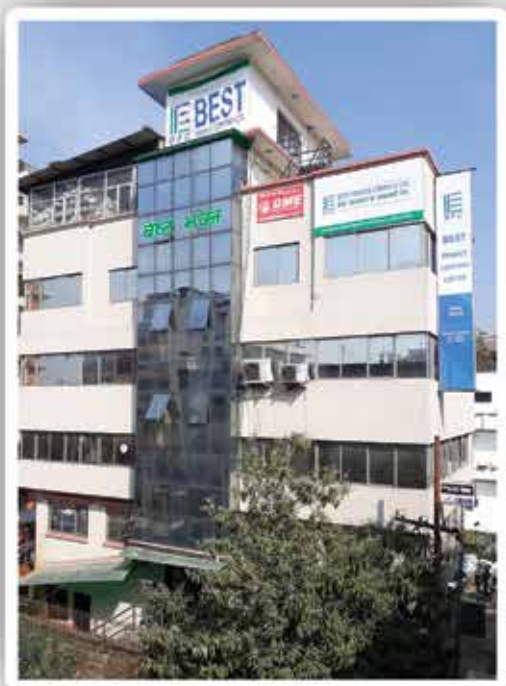
Best Building Kamaladi, Kathmandu